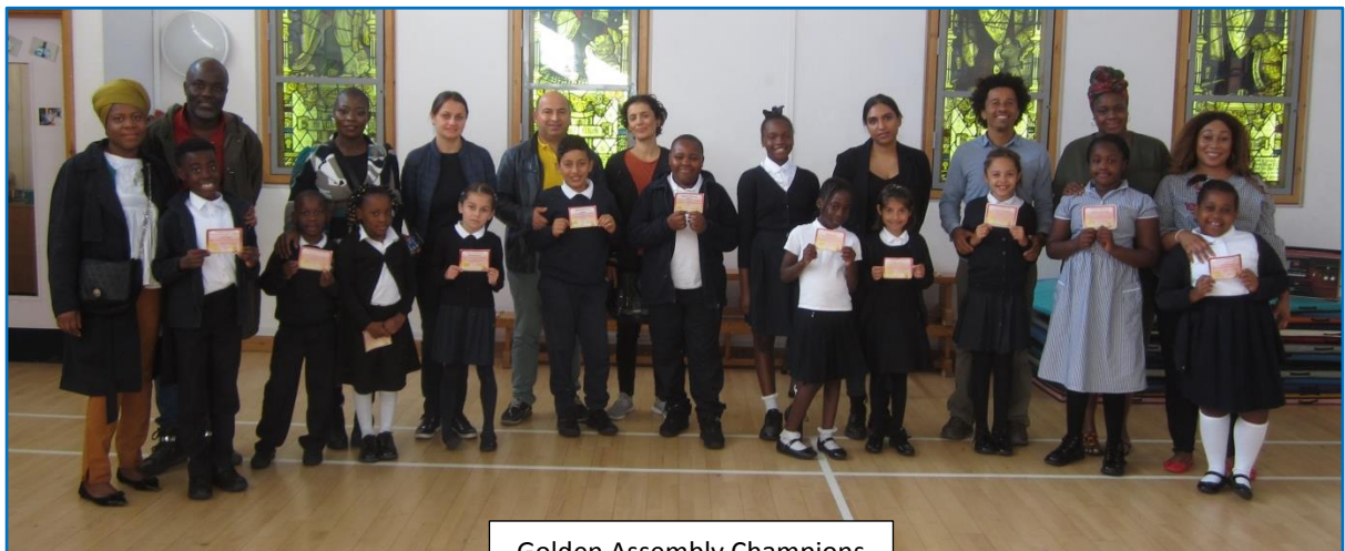
Golden Assembly Champions