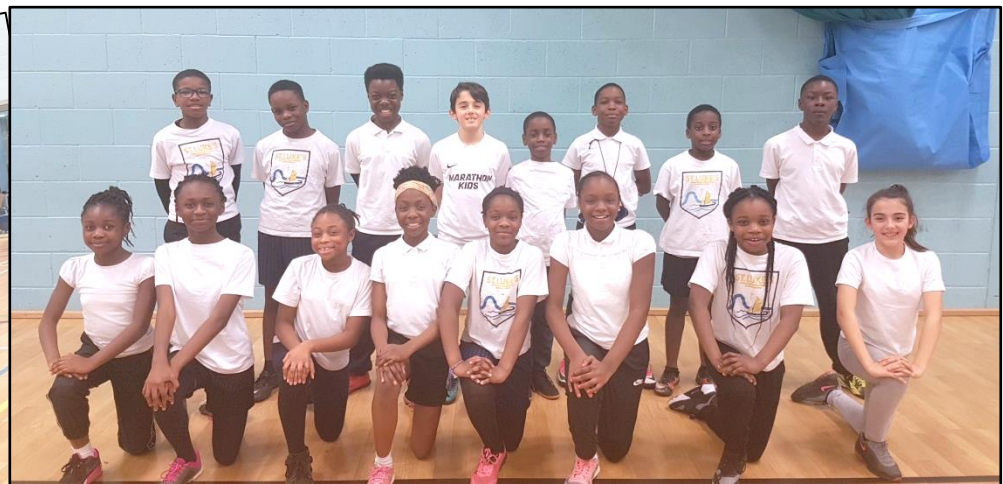
Our championship qualifying Athletics squad!