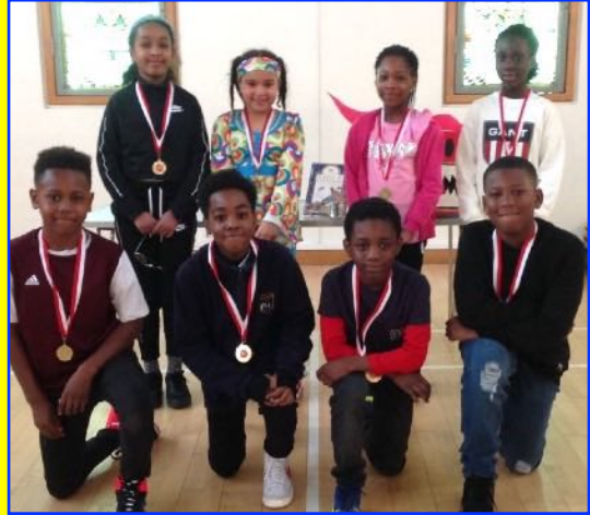
Y3&4 Athletics Stars