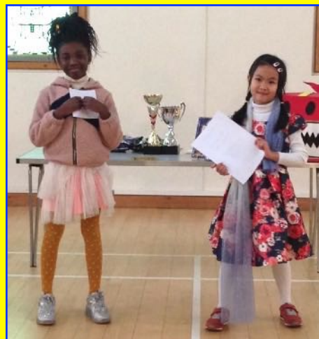
Y2 Birthday & Piano Certificate