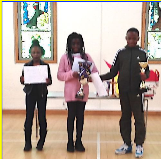
Y5 & Y6 Stars & Y6 are KS2 class of the week - again!

And remember the school closes for Half-term next Friday the 11th feb. at the normal time and re-opens on Monday the 21st Feb. at the normal time.