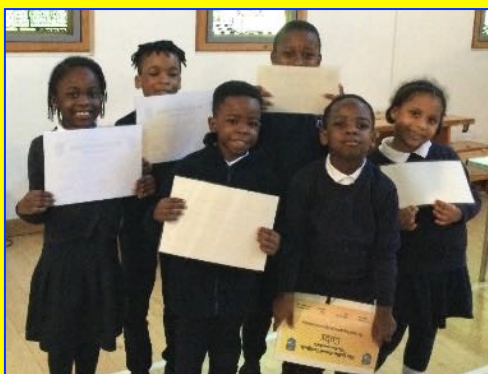
YR, Y1 & Y2