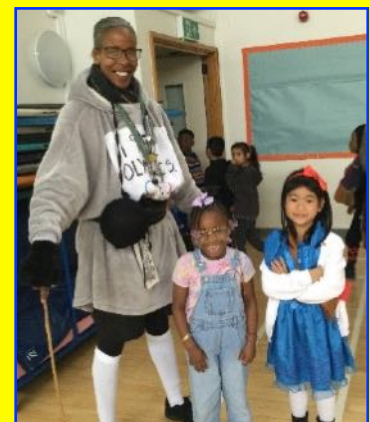
Miss Trunchbull & students