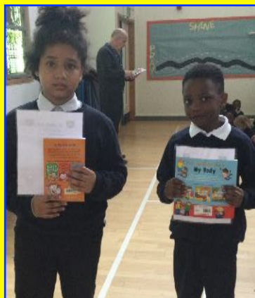
Most Improved at Sport