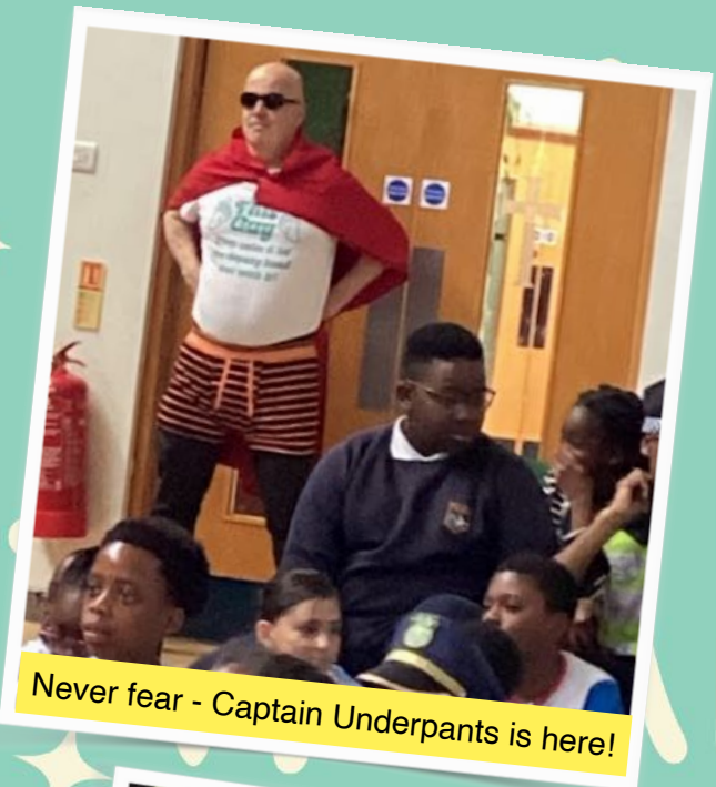
Never fear - Captain Underpants is here!