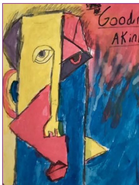
Cubist artwork in Y4