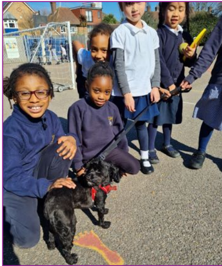
Y2s with Pepper