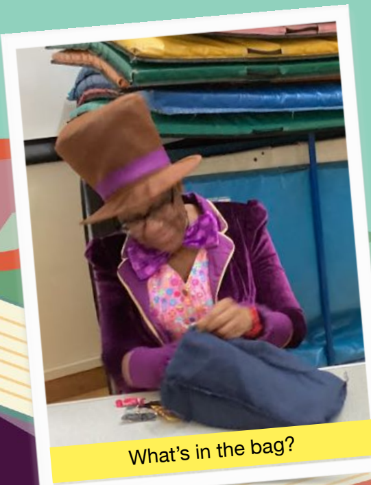
What's in the bag?