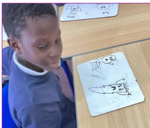
Y5 webinar with the author Michael Rosen