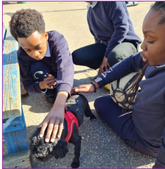
'Being with dogs makes me calm'