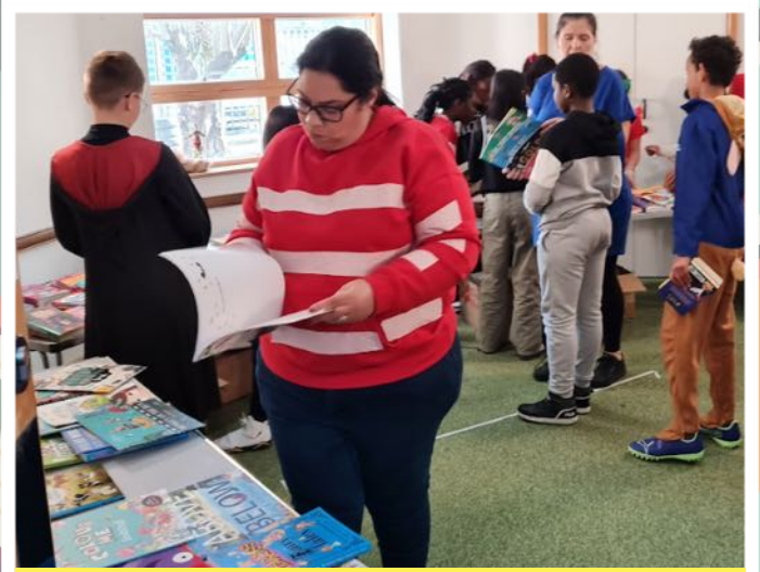
Books galore! Something for everyone...