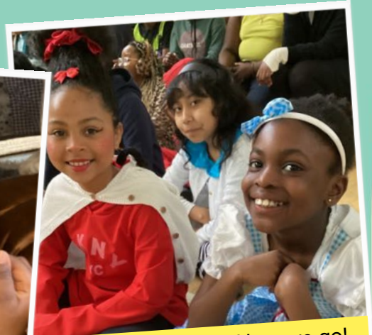
Excitement builds... Here we go!