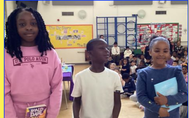
Special HT Awards