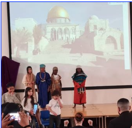
Money lenders in the Temple