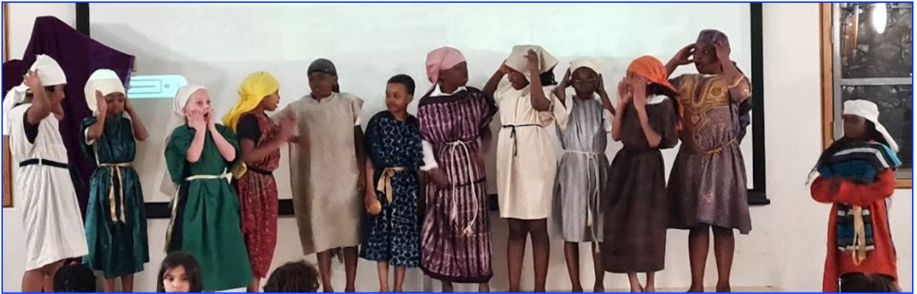
The disciples learn of the coming betrayal