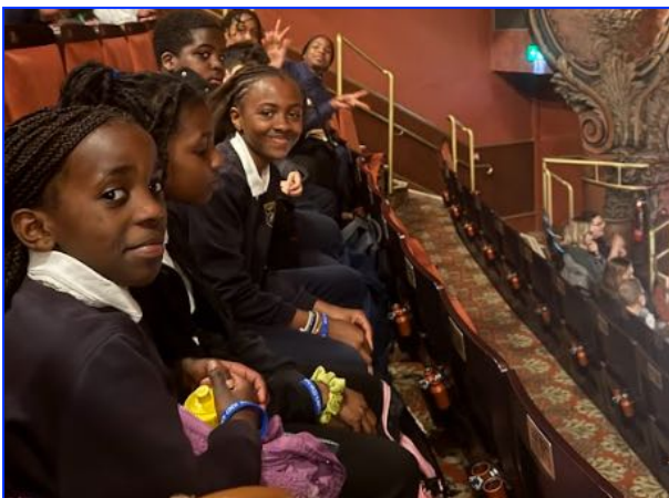
Y6s during their visit to the Lion King