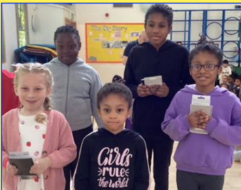
Winners of the homework on the theme of Jesus entering Jerusalem