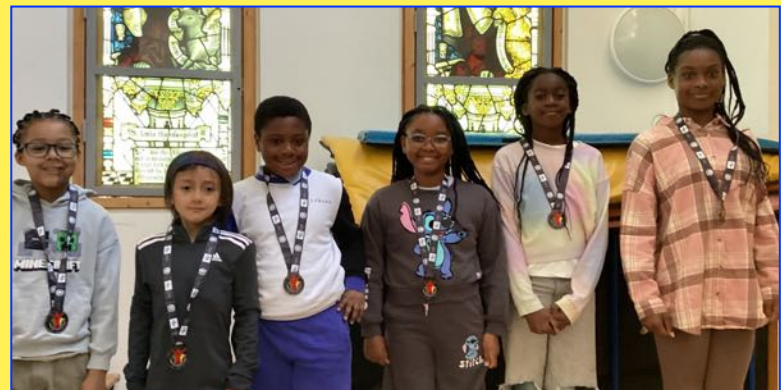
The Bowling team from the London Games