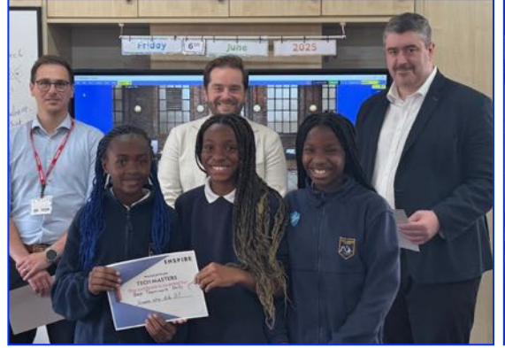
Y6 making their 'pitch' to the Dragon panel