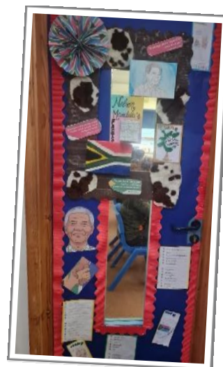
Y6 Nelson Mandela