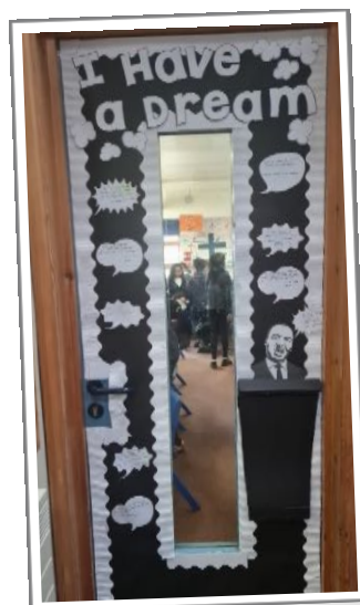
Y5 Martin Luther King