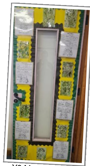
Y2 Mary Seacole