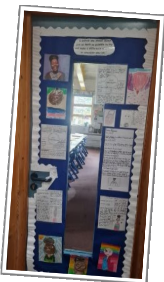
Y4 Floella Benjamin