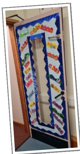
YN & YR Queen Elizabeth II

The children have been researching a biography about a famous person and then used that information to create a display for their art work with quotes from them.