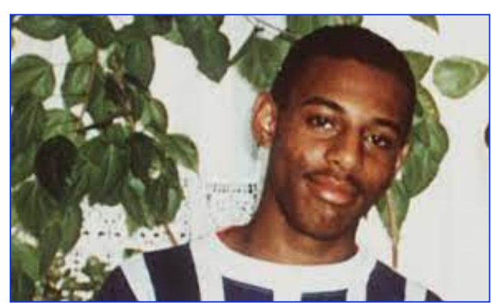
Here are some books/links you could share with your family which both celebrate and build on our assembly today: