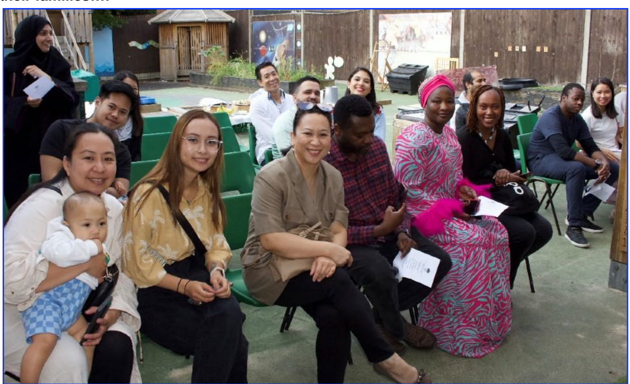
Coding - together