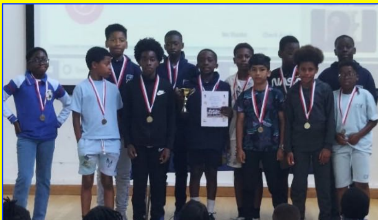
The U9 Boys Football Champions