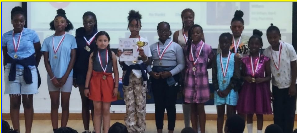
The U9 Girls Football Champions