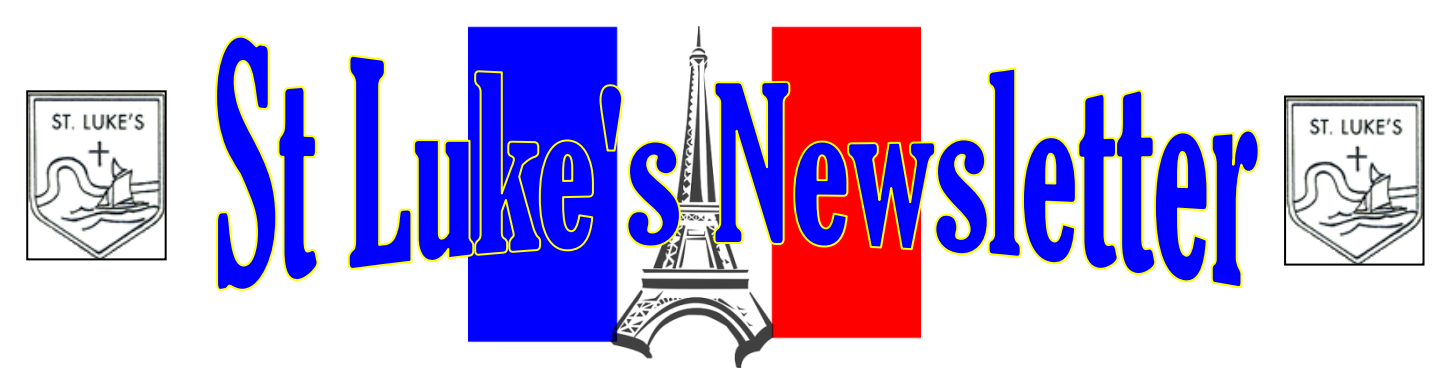
Friday 29th June 2018