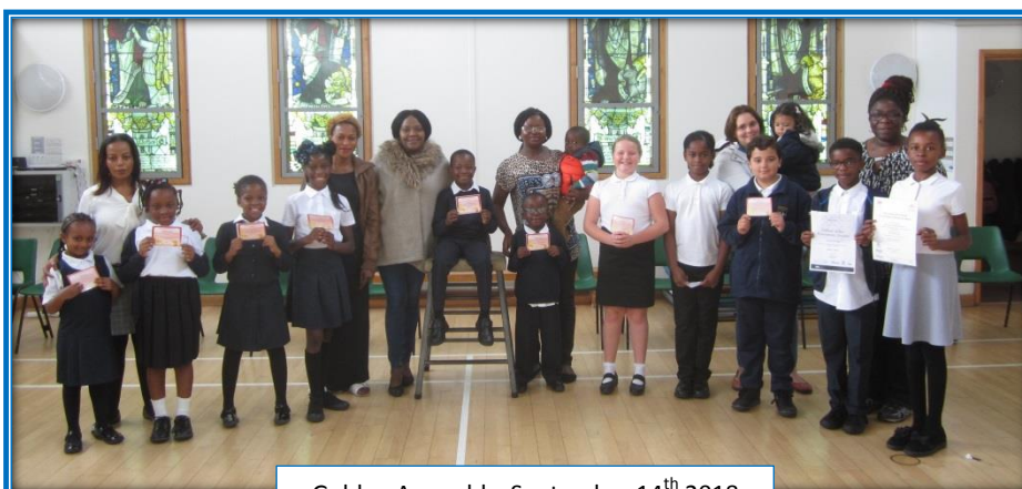
Golden Assembly September 14 th 2018