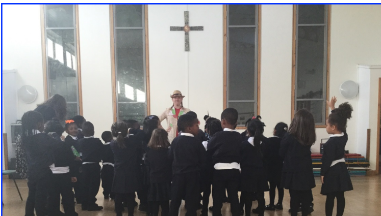
Fun and learning: Early Years discover the joy of Handa's Surprise

We have been celebrating Black History Month through hands-on workshops for all year groups. The Early Years and Year 1 took part in a practical session around the story of Handa's Surprise and Y2 took part in an interactive experience based on the life and work of Mary Seacole, a nurse who helped change care standards during the Crimean War. Years 3-6 had workshops focused on