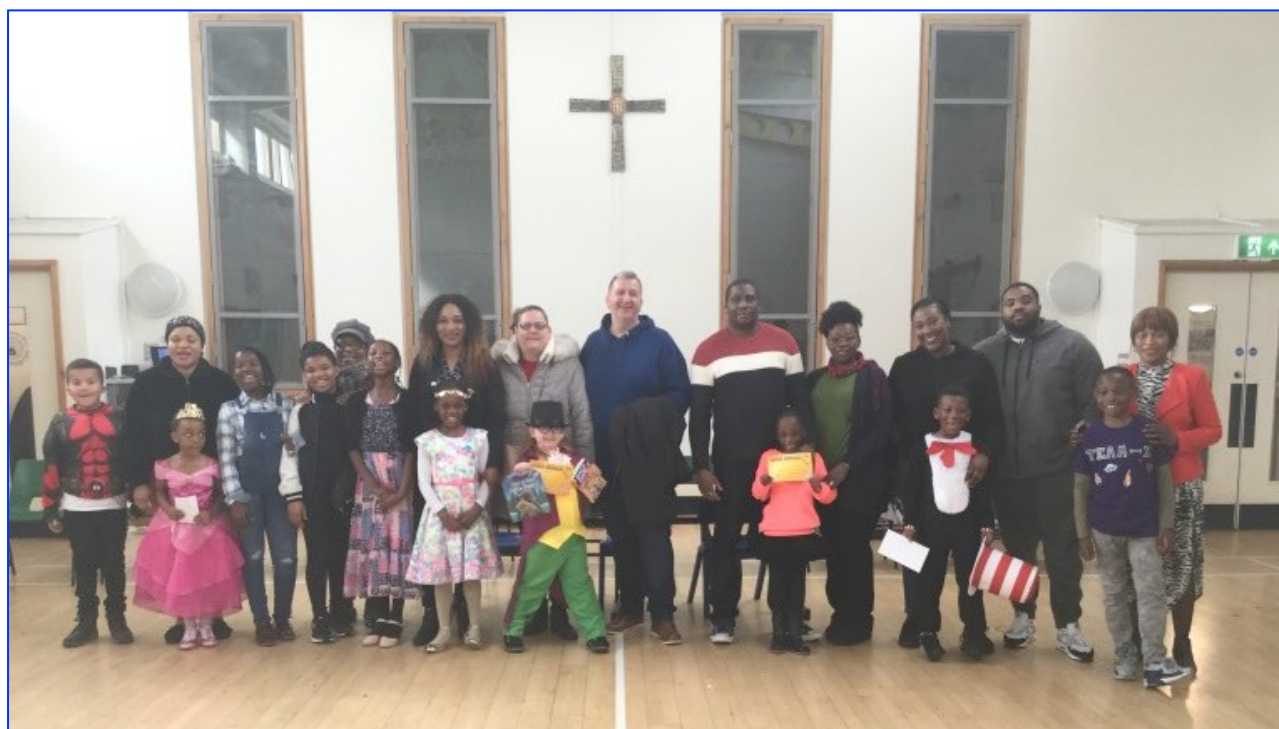
Our golden assembly children and families for this week.