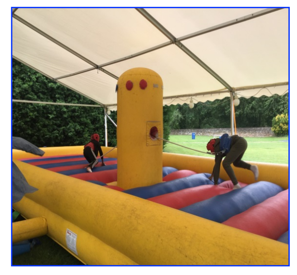
A softer form of combat