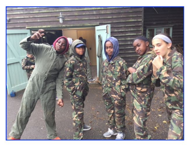
Don't mess with the A-Team!