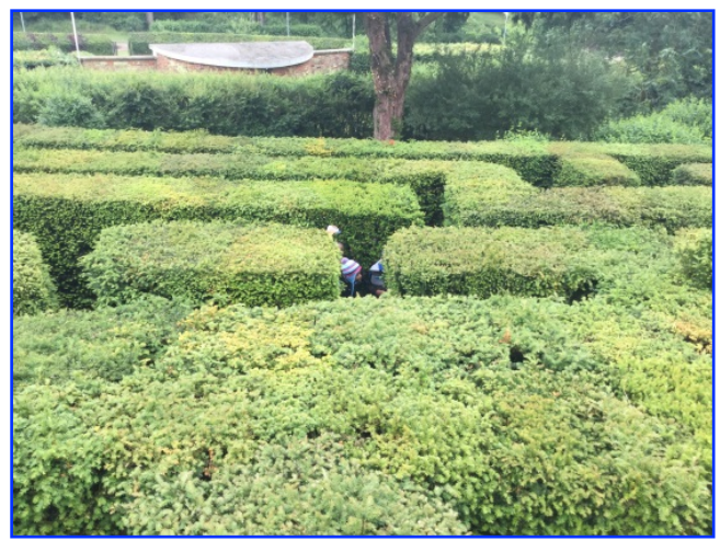
Left or right in the maze?