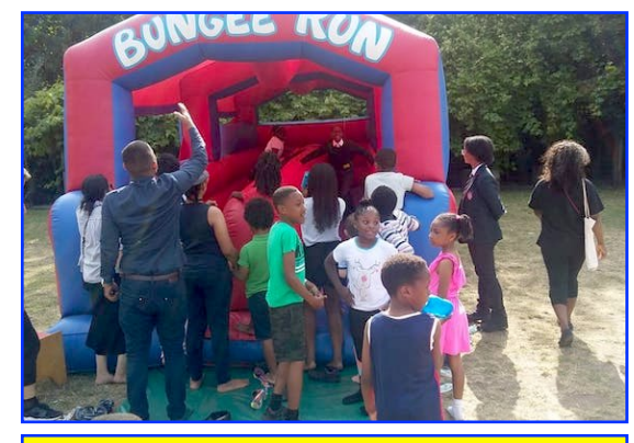
Fun & games at our Annual International Fete