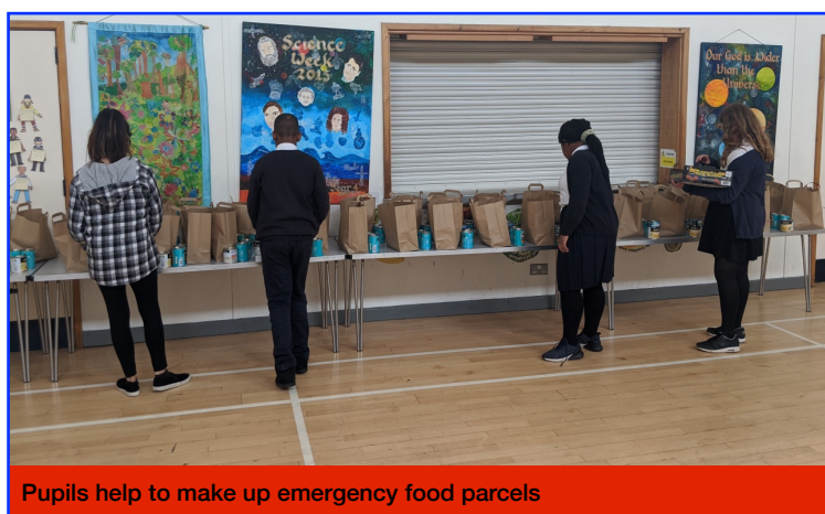
Pupils help to make up emergency food parcels

for those KS2 children that are in school. This was a pilot aimed at testing the technology and it seemed to work better than Zoom and is more secure! The next step for ourselves and Newham Music is to see whether we can deliver similar lessons to your children at home – we are working on it and hopeful we will be able to do this soon – look out for more news.