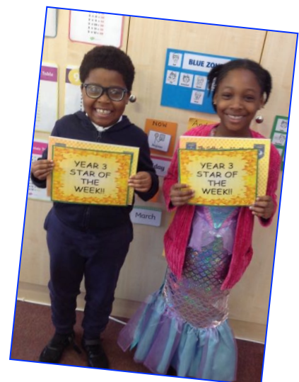
Nursery, Reception & Y3