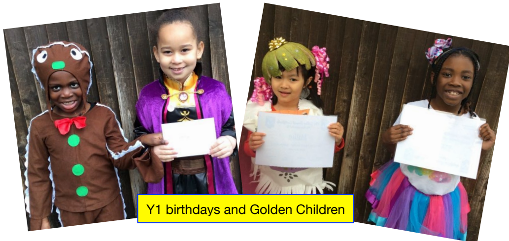
Y1 birthdays and Golden Children