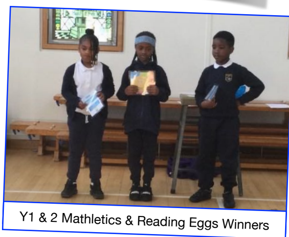
Y1 & 2 Mathletics & Reading Eggs Winners