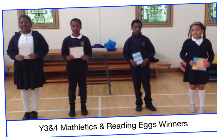
Y3&4 Mathletics & Reading Eggs Winners