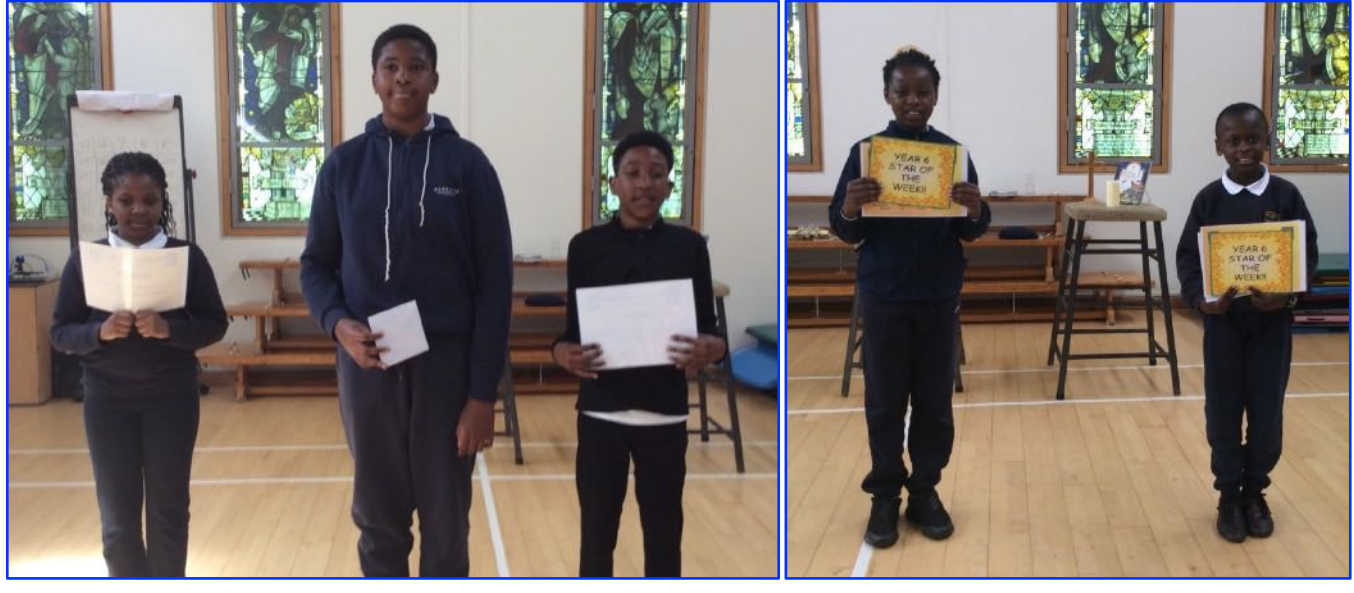
TOP ROW (L-R): NURSERY, RECEPTION, Y1 MIDDLE ROW (L-R): Y2, Y3, Y4 BOTTOM ROW (L-R): Y5 & Y6 BIRTHDAY, Y6