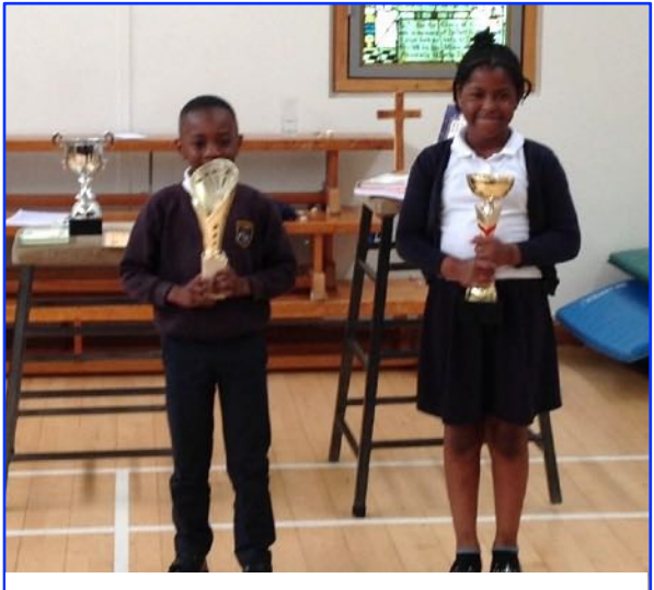
Mathletics & Reading Eggs Champions Y3