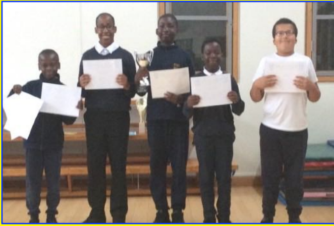
Y6 -Class of week