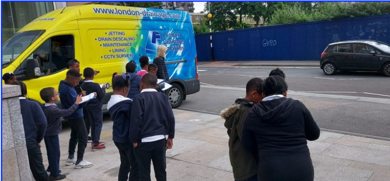
Y2 data collecting data on the amount of traffic using Rathbone St