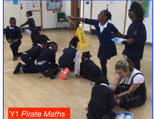
Y1 Pirate Maths