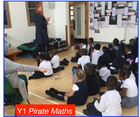
Y1 Pirate Maths

Maths is something we are always working hard to improve in our school. We have spent the last couple of weeks adapting our curriculum for next year so it best addresses the gaps that have been caused by 16 months of disruption in schools. Alongside this we have worked hard to ensure booster programmes for the next school year targeted at those who need it the most. But maths should be fun as well as functional so during the week of 28 th June – 2 nd July we held a Maths Week aimed at helping the children have fun solving problems outside of their classrooms. See below for some pictures of the children using their maths skills in the wider world