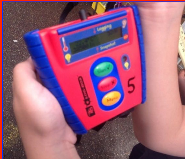
Y4 contrasting different readings between traditional and new ways to detect temperatures