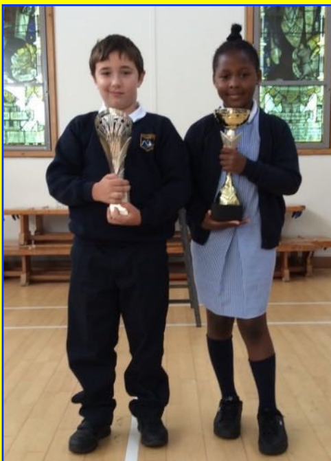
Y4 - Reading and Maths champs!