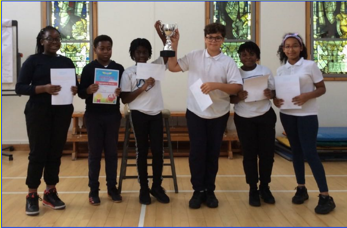
Y6 winners and with the class of the week trophy for all their hard work on their practise SATs this week