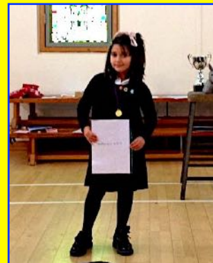
Y3 & Reading Champion