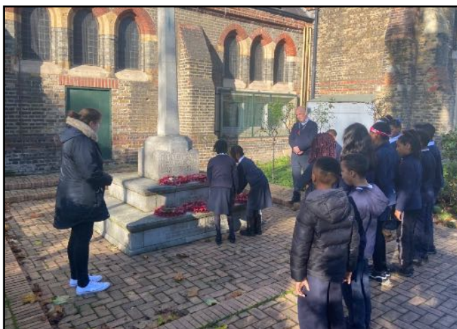
To the Fallen: laying our poppy wreaths at the Cenotaph