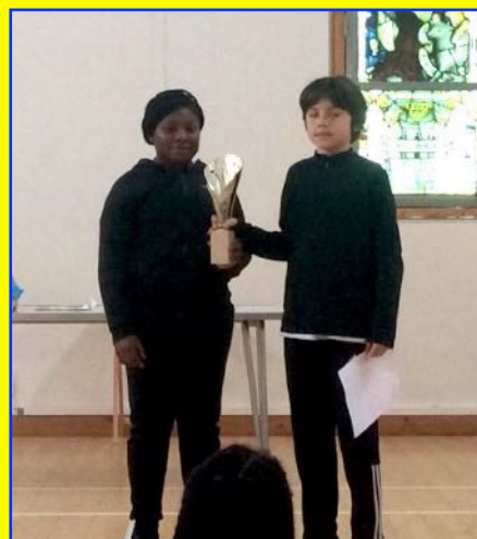
Y6 are the champion readers