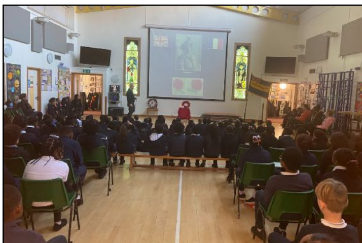
Remembrance: The history of the Poppy and why we wear it