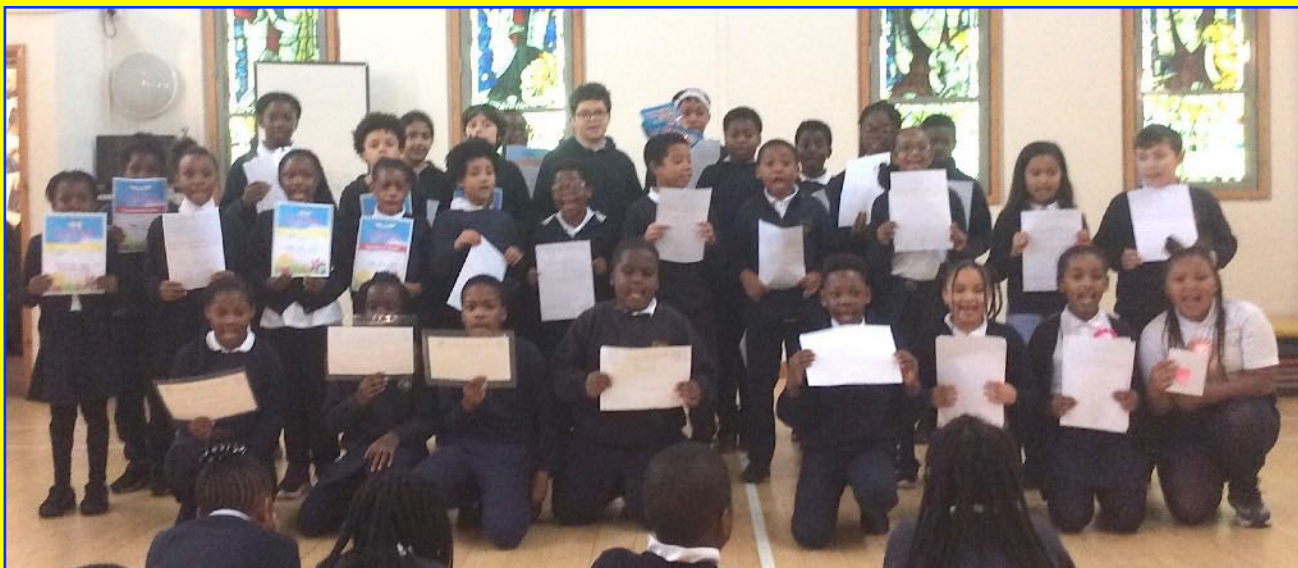
Y3,4 & 6 - Stars of the Week backed up by our reading and maths stars