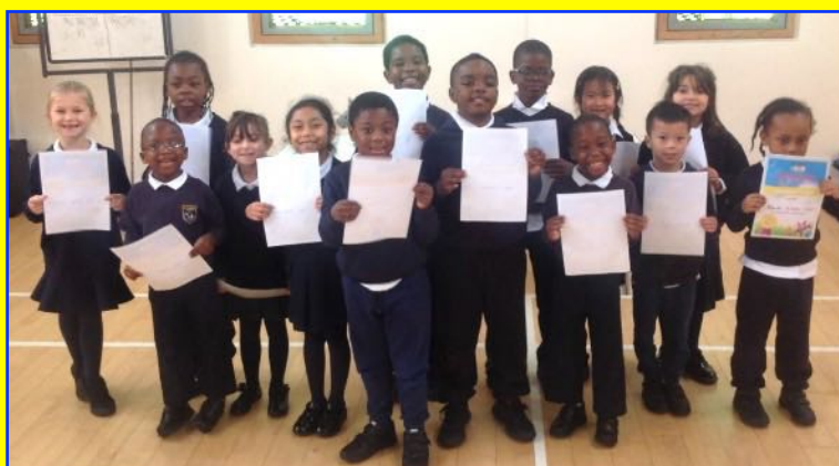
Stars KS1 reading & maths stars