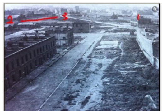
Aftermath: little was left of Canning Town

We finished by telling the story of two women, Moina Michael and Anna Guerin, who are the reason why the poppy is the image not only of remembrance but also of the wish for peace in our world. Afterwards, a group of children went to over to the Cenotaph at St Luke's church to lay our wreaths.