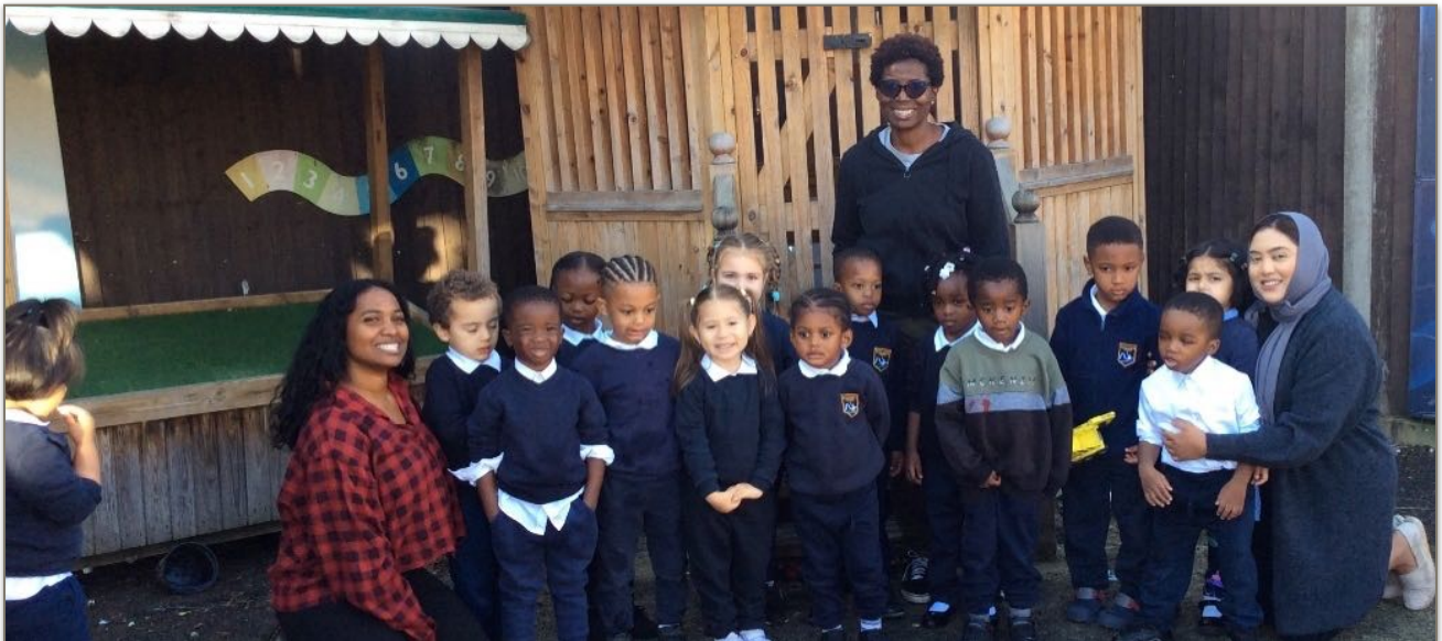
Welcome to our Nursery class

It is my job to 'tie' the week together for the newsletter and I am always pleased with the breadth of learning that the children are engaged in. There is an awful lot of emphasis from politicians on the importance of basic skills and this is right - but it is also really important that they want to 'apply' these skills, so motivating them with a lot of different options for subjects and jobs they may like, hence the many and varied activities in the life of a busy school. I hope you enjoy scrolling through.