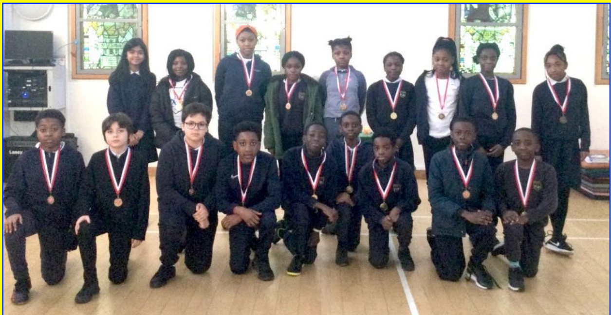
Y5&6 team that has qualified for the chance to represent Newham at the London Games