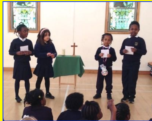
Y1 & 2 Birthdays