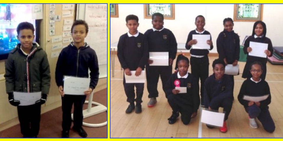
YR, Y1 & Y2