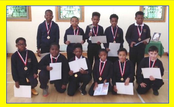
Y3&4 Boys' Handball victors