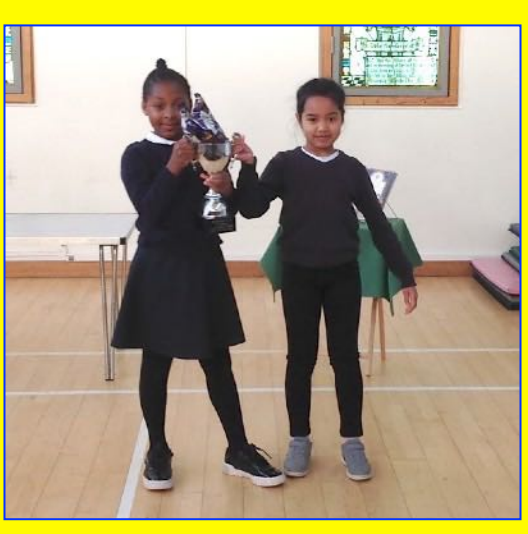
Y4 - Class of the Week