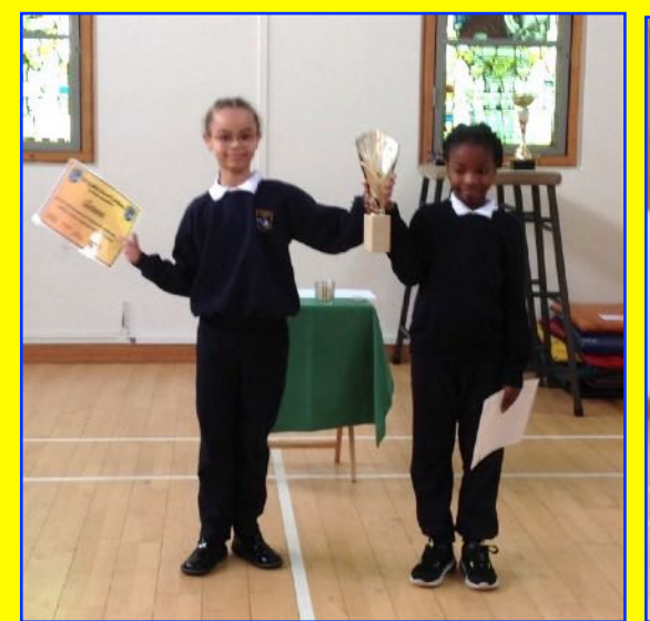
Y3 Stars & Reading Champs