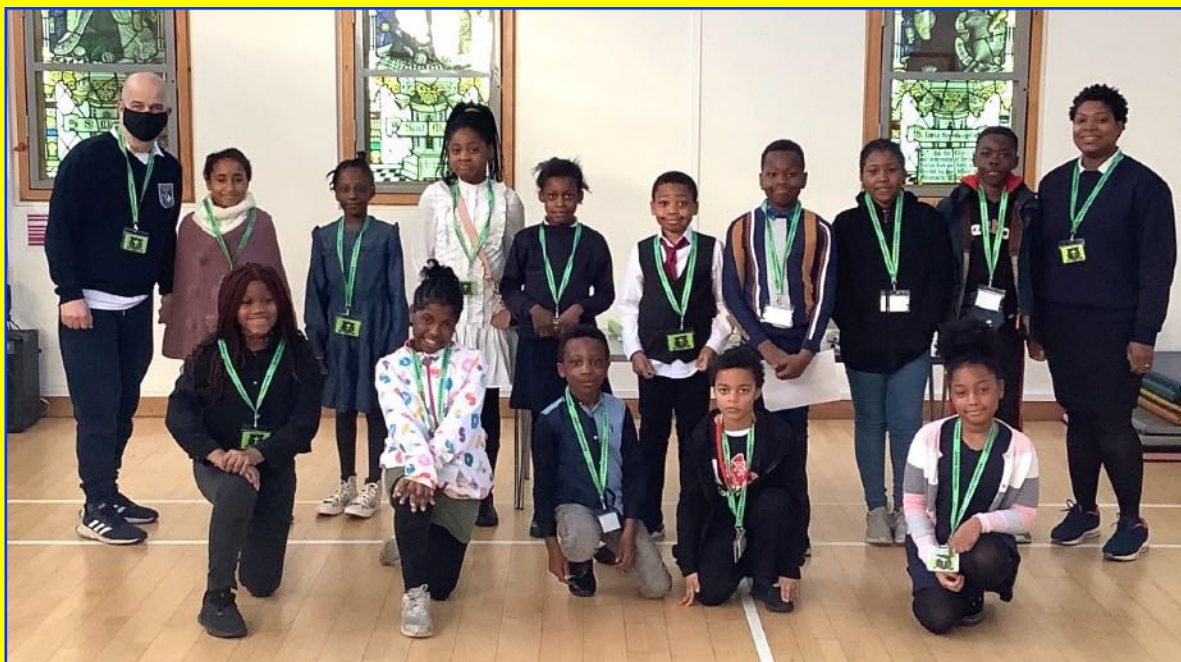
The Justice Committee (minus Y6) with their new badges