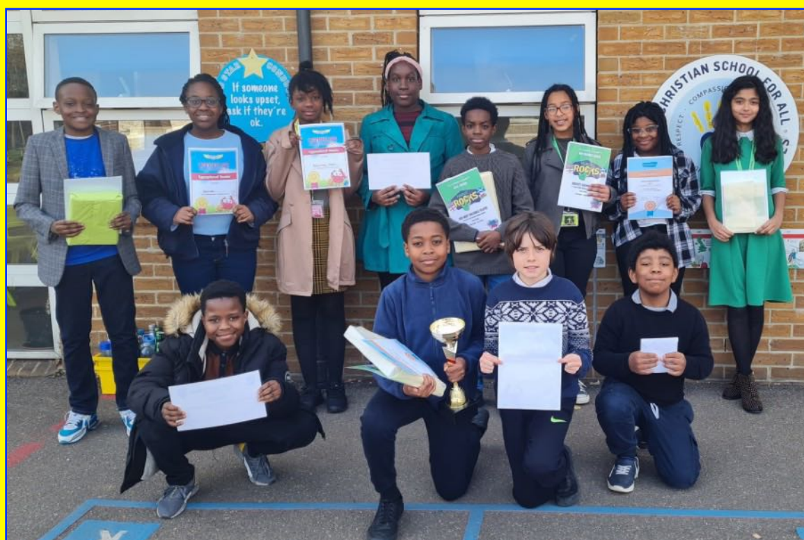
Y6 Stars of the week, birthdays and Timetable Rockstars winners