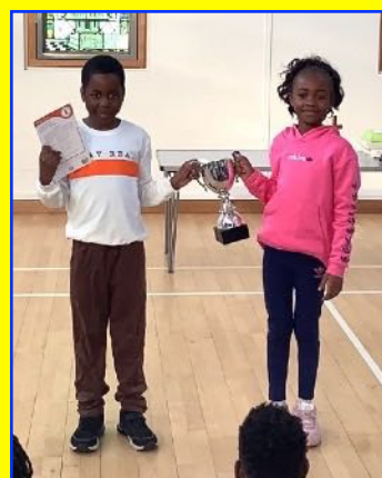
Y3 KS2 Class of the week