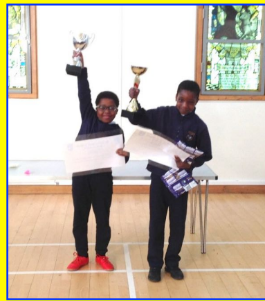
Y4 Stars, Class of the week & Maths champions!