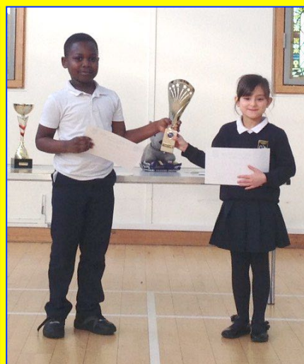
Y2 Stars and reading Champs