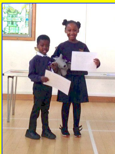
Y1 Stars & also class of the week