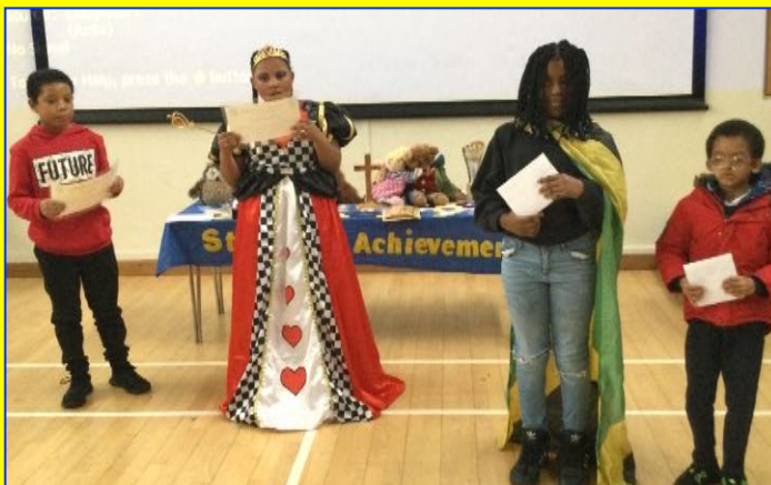
Y4 Stars & Y3/4 Birthdays