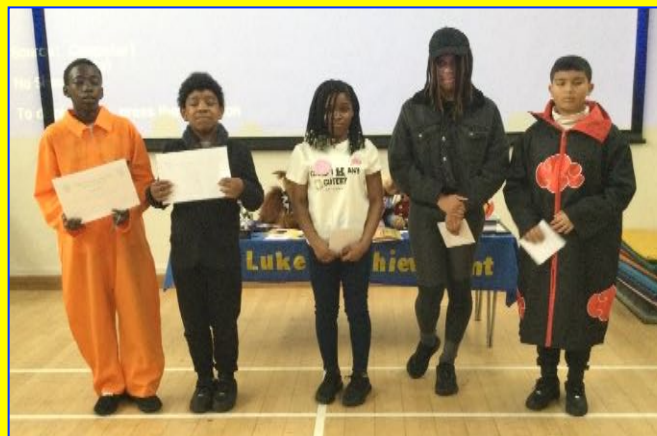
Y6 Stars & Birthdays