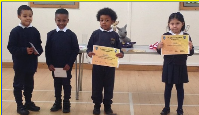
YR Stars & Birthdays