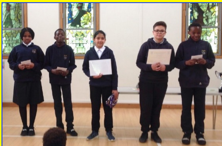
Y6 Stars and Birthdays & Reading Champs