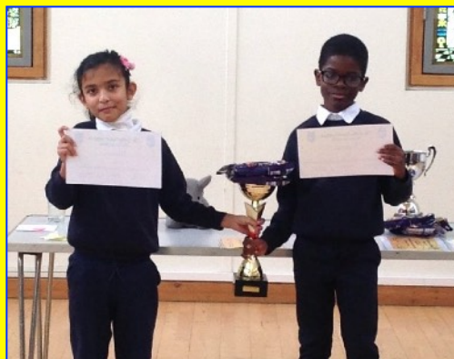
Y2 Stars & Athletics Champs!