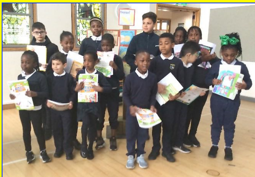
Best boys and girls of the Spring Term for each class