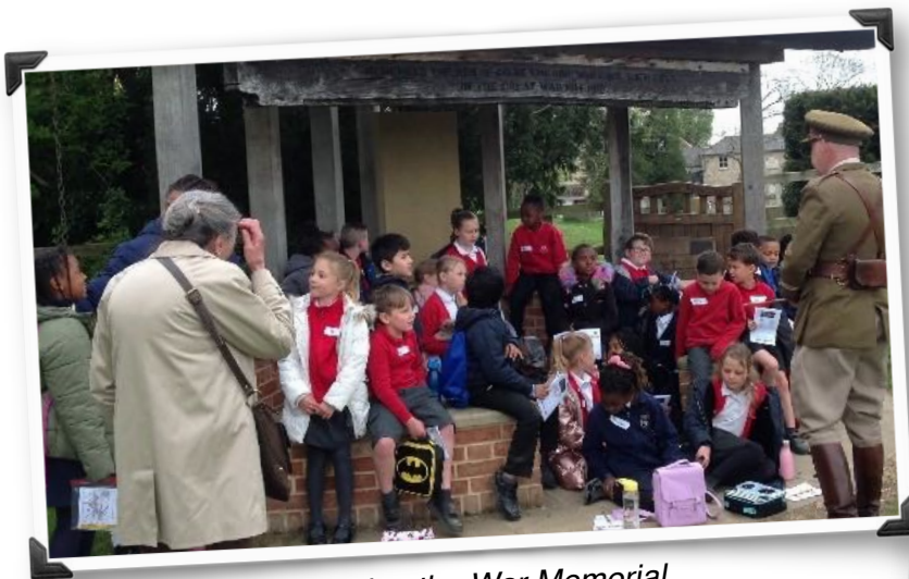
Visiting the War Memorial