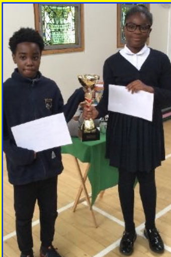
Y4 Stars & Maths champs