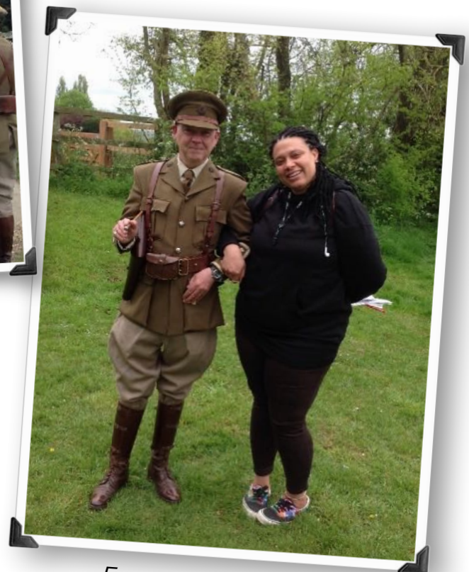
Everyone loves a soldier!