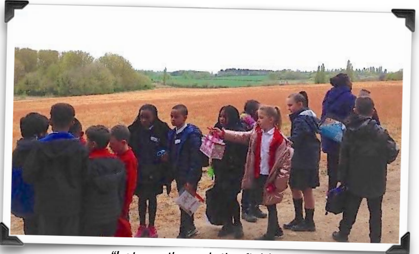
"Lets go through the fields!"

It did not take long for the chats and the fun to begin, followed by a walk through the fields and visits to a war memorial and a church dating from the 11th Century. However the biggest treat of the day was just how nicely the children got on with each other – they were a massive credit to their families and their schools. We can't wait for them to come to us at the end of June!