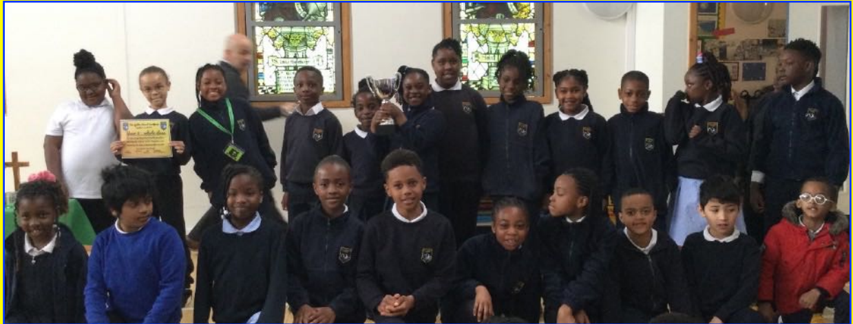
Y3 Class of the Week in KS2