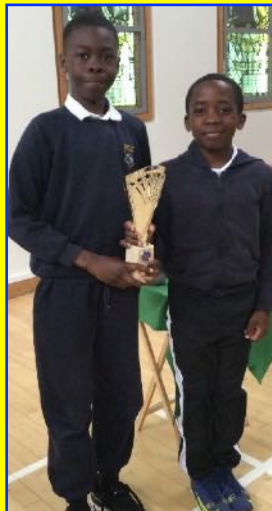
Y5 Reading Champs