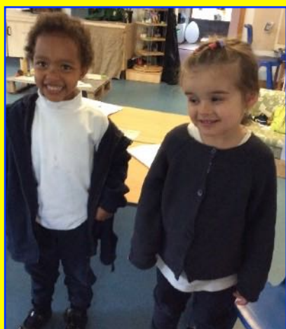
YN Stars & Infant class of the week