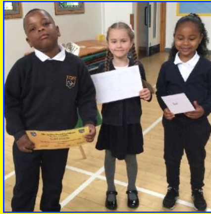
Y1 Stars and Birthday Girl