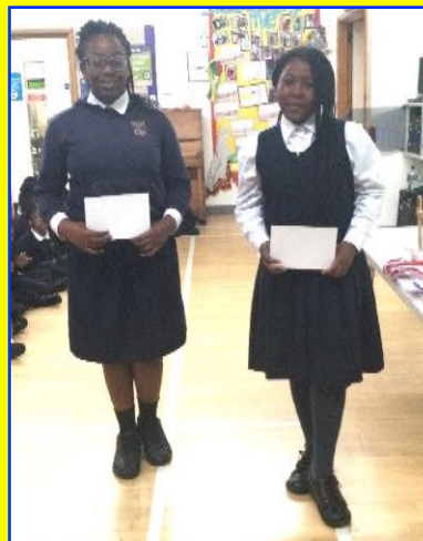
Headteacher's Special Award