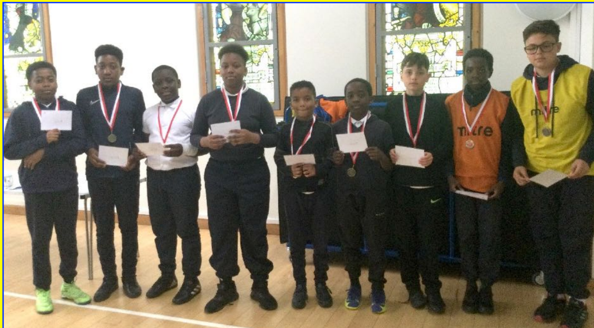
Y5/6 Handballers who finished runners-up in the borough finals