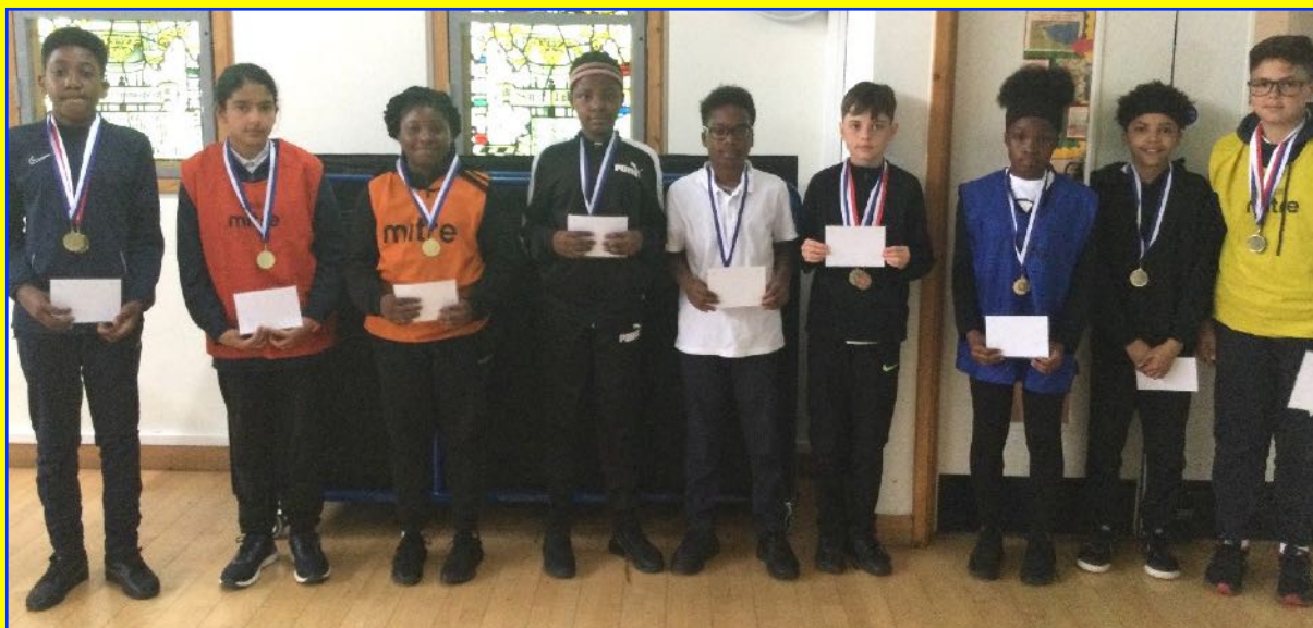
Y6 Basketball team that finished in 3 rd place in the borough finals