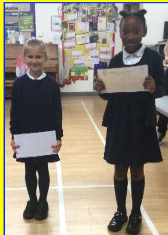
Y2 Stars of the Week