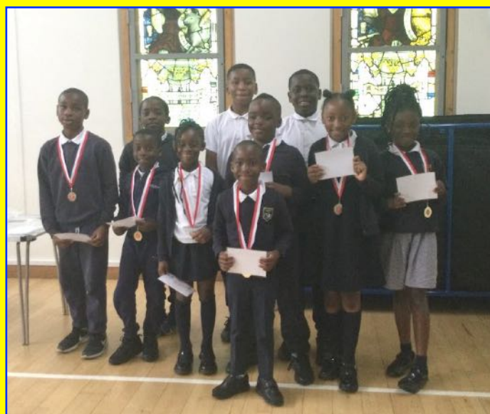
Y1/2 Handballers and coaches