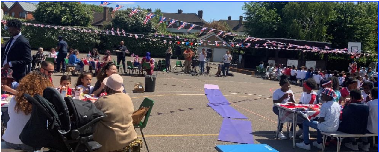
The band from Newham Music entertains the crowd