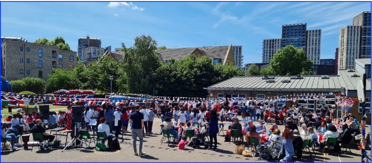
Over 100 visitors came from local sheltered housing, St. Luke's Church and our own parent body

On Friday the 1 st of July we will be holding another event which will be to celebrate all the different cultures that our school represents – details to follow!