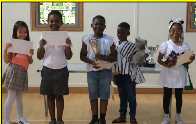
Y2 Stars of the Week