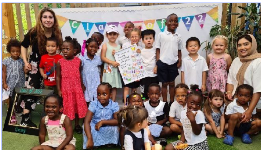
YN – they were all winners!!!!