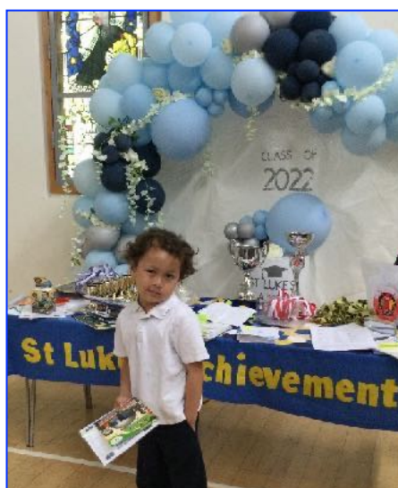
YR (Thalita was away)