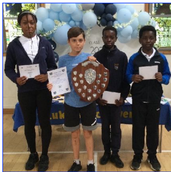
Sports Person of the Year & runners up