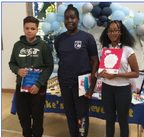
Y6 – 2 best Girls!