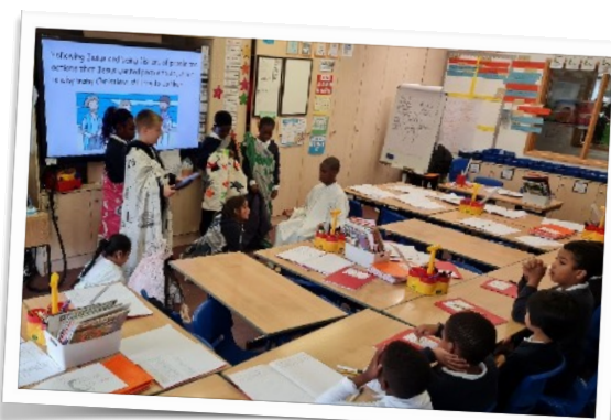
Y3 being Fishers of Men in their RE lesson

In an excellent RE lesson this week, Y3 reenacted the moment Jesus called upon his first disciples - Simon called Peter, and Andrew - who were fishing on the Sea of Galilee. Jesus called them and said, "Follow me, and I will make you fishers of men" and used them to spread his word of peace.