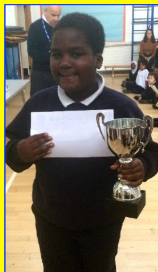
Y4 & Class of the Week