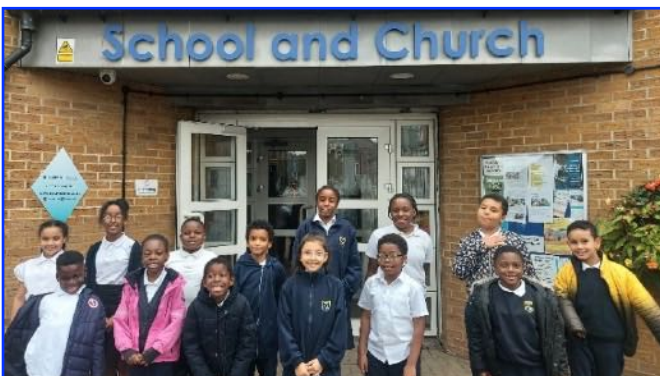
Eco Committee ready to meet the DFE representative

Below are pictures of our 2 main committees after the classes voted for their reps.