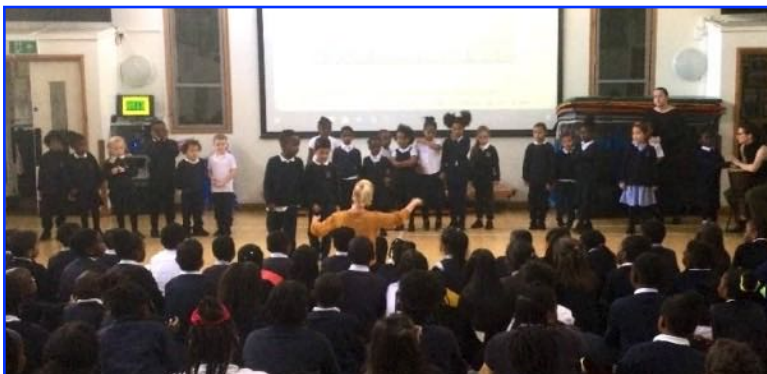
Y1 singing Acapella