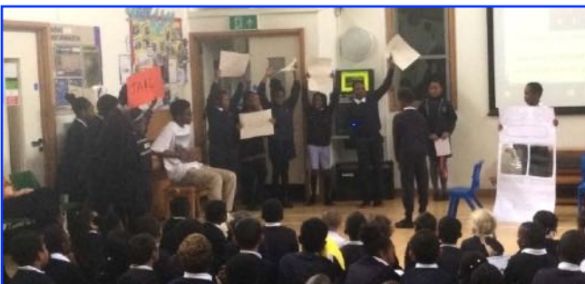
The Bus Boycott led by Rosa Parks Y4

And then on Friday we held a celebration assembly for Black History Month but at the same time agreed our aim was to be in a world that didn't need to hold such an event because we had achieved a just and kind world around us. We talked about St. Luke's curriculum journey and to continue that: how we need to link events such as the Alabama bus boycott (that we learn about) started by the resistance to racism from Rosa Parks, to the Bristol Bus Boycott that it inspired in this country in 1963 as well as making a firmer link between our end-of-year Cultural Day and the Notting Hill Carnival as a celebration of cultural identity.