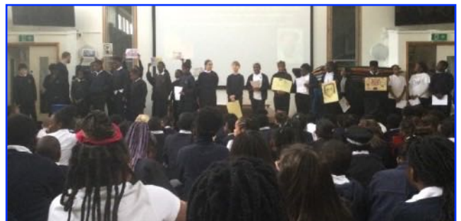
Y6 celebrating the art of John Michel Basquiat