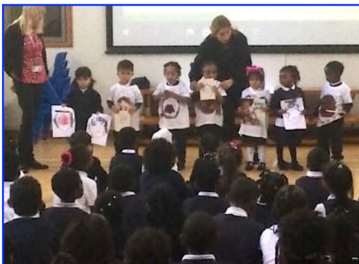
YN looking great