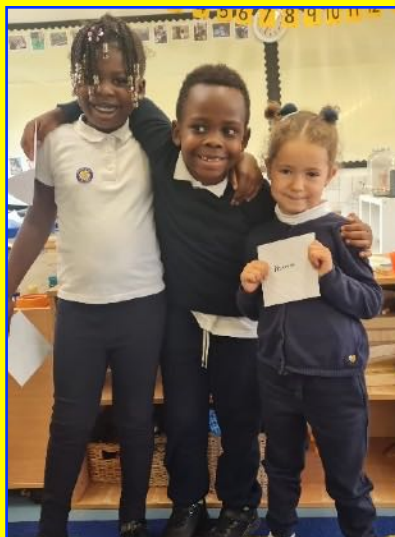
KS1 and EY Birthdays