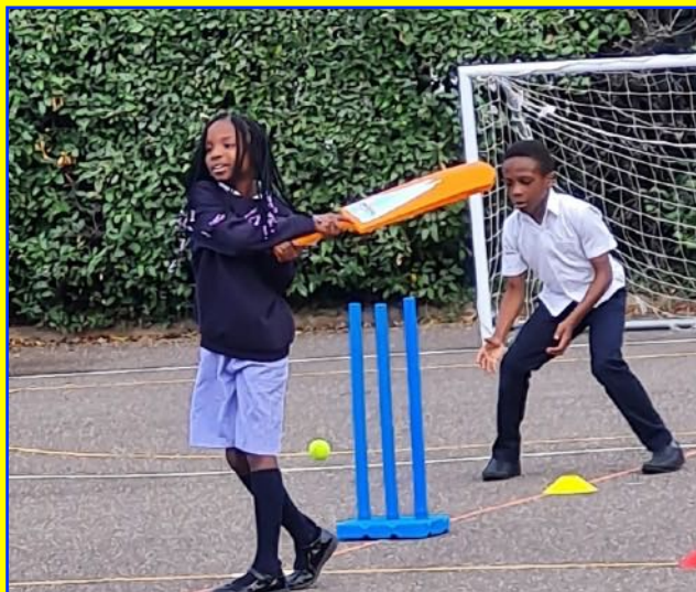
Y4s enjoying their last session of cricket from Platform Cricket

Remember there are local activities going on this half term (free for 5-10 yr olds) see flyer at end of letter, and please also help Newham services with a survey of childcare needs.