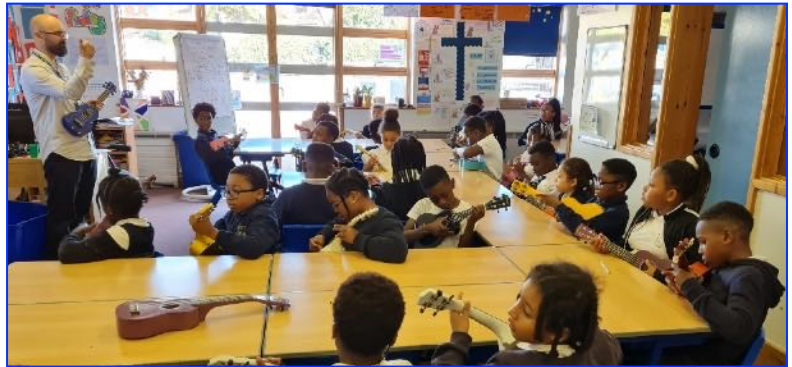
Y5s strumming their ukes

All of this fantastic music engagement is provided by our excellent partners at Newham Music and remember it is free for your children to attend the Newham Music sessions at Chobham School every Saturday morning - just say to them you are from St. Lukes!