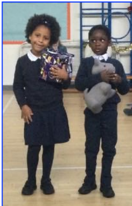
Y1 class of the week